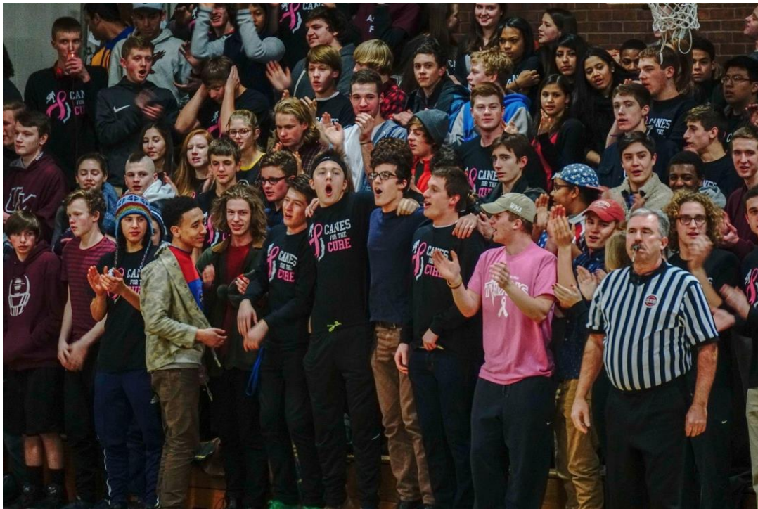
Canes Nation 2014-2015